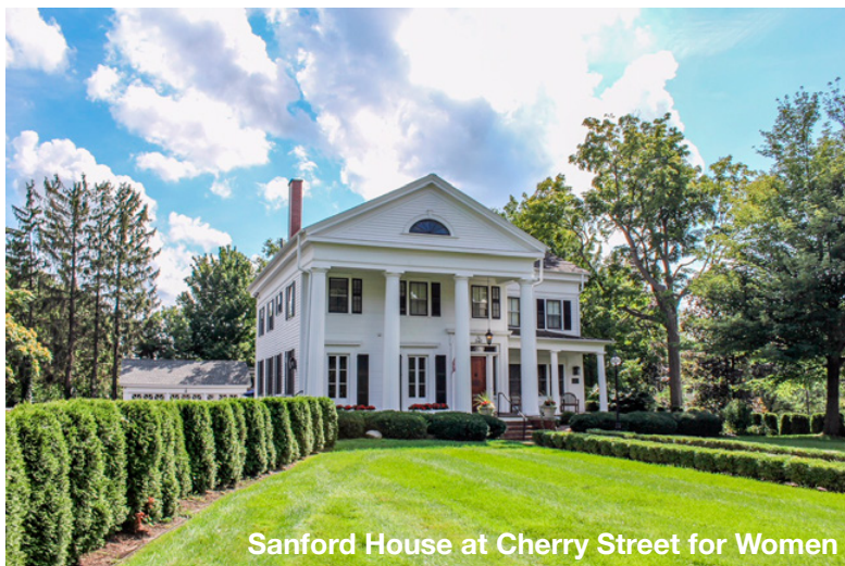
Sanford House at Cherry Street for Women